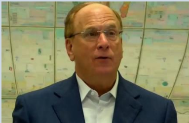
Mr Laurence Fink Founder Chairman and CEO BlackRock

The webinars covered a wide range of topics, such as global economic, financial and political issues, talent development and personal stories of success. Responses to these webinars were encouraging, with altogether more than 800 participants joining real-time and more than 850 people watching video replays afterwards.