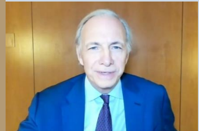
Mr Ray Dalio Co-Chairman and Co-Chief Investment Officer Bridgewater Associates