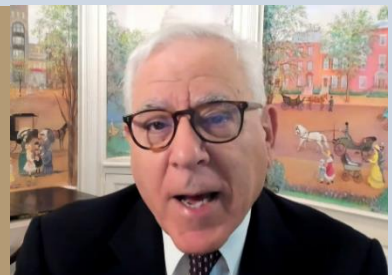
Mr David M. Rubenstein Co-Founder and Co-Chairman The Carlyle Group